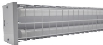
Emergency Wire Guard Batten