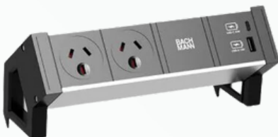
BACHMANN DESKTOP POWER OUTLET WITH USB INTERFACE BLACK