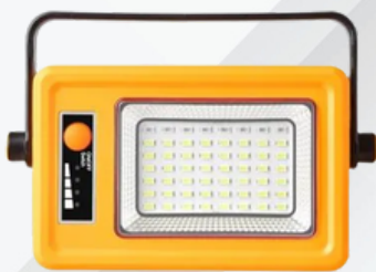
VERTEX 4W PORTABLE SOLAR WORKLIGHT