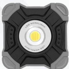
WAROM 10W RECHARGEABLE PORTABLE LED WORK LIGHT IP54 6500K