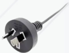
JQ 2 CORE ROUND PLUG LEAD GRAY