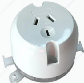
90MM SINGLE SOCKET PLUG BASE LARGE