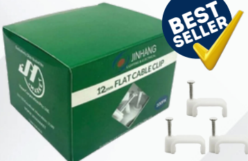
FLAT CABLE CLIP 12MM 100PK SUITABLE FOR 2.5MM 2 TWIN+EARTH