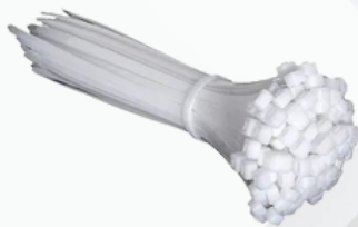
JINHANG 5X200 UV RESISTANT CABLE TIE WHITE 100PK