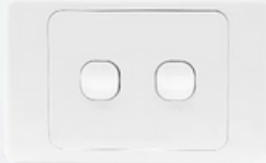
10A 2 GANG WALL SWITCH