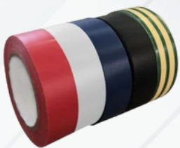
VINYL ELECTRICAL INSULATION TAPE MIXED (PACK OF 5)