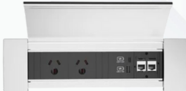
BACHMANN EMBEDDED POWER WITH USB INTERFACE