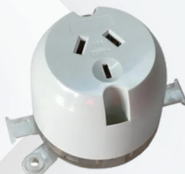
70MM SINGLE SOCKET PLUG BASE SMALL