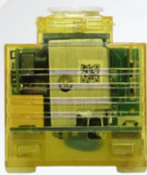
VERTEX WI-FI PUSH BUTTON LED DIMMER