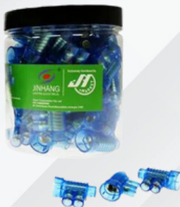
JINHANG DOUBLE SCREW CONNECTOR - 50PCS