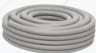
FLEXIBLE CORRUGATED CONDUIT MD GREY