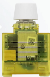
VERTEX WI-FI ROTARY LED DIMMER