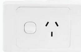
10A SINGLE WALL SOCKET