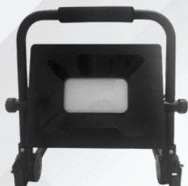
WAROM 50W LED PORTABLE WORK LIGHT IP65 6500K BLACK 110D