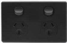
SLIM 10A DOUBLE WALL SOCKET MATTE BLACK